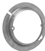
TP326, TP331, TP332, TP333