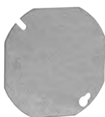
TP322, TP853 B