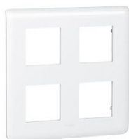
PLATE MOSAIC - 2 X 2 X 2 MODULES - WHITE