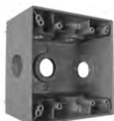
TP7137, TP7138, TP7142