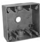
TP7086 – TP7090