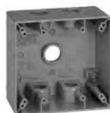
TP7126, TP7130, TP7134

2 5/8" DEEP, ALL BOXES ARE STANDARD WITH MOUNTING LUGS CAST ALUMINUM – UL LISTED FOR WET LOCATIONS